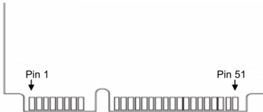
Figure 1-2: mini mSATA A pin assignment

Pin assignment of the mini mSATA A is shown in Figure 1-2 and described in Table 1-3.